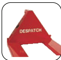
The company name or logo can be cut out in the triangle of the Panther.