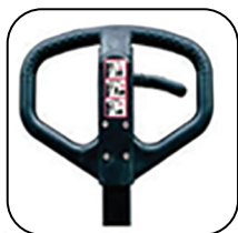
Ergonomic handle ensures the user a relaxed hold. Can be marked with name/department.