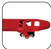
The hoop skates on the forks ensure an easy fork insertion and withdrawal in/out of pallets.